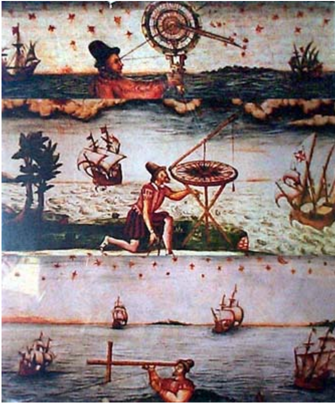
Upon discovering Ptolemy's geography Columbus was convinced that the Indies could be reached by sailing West.