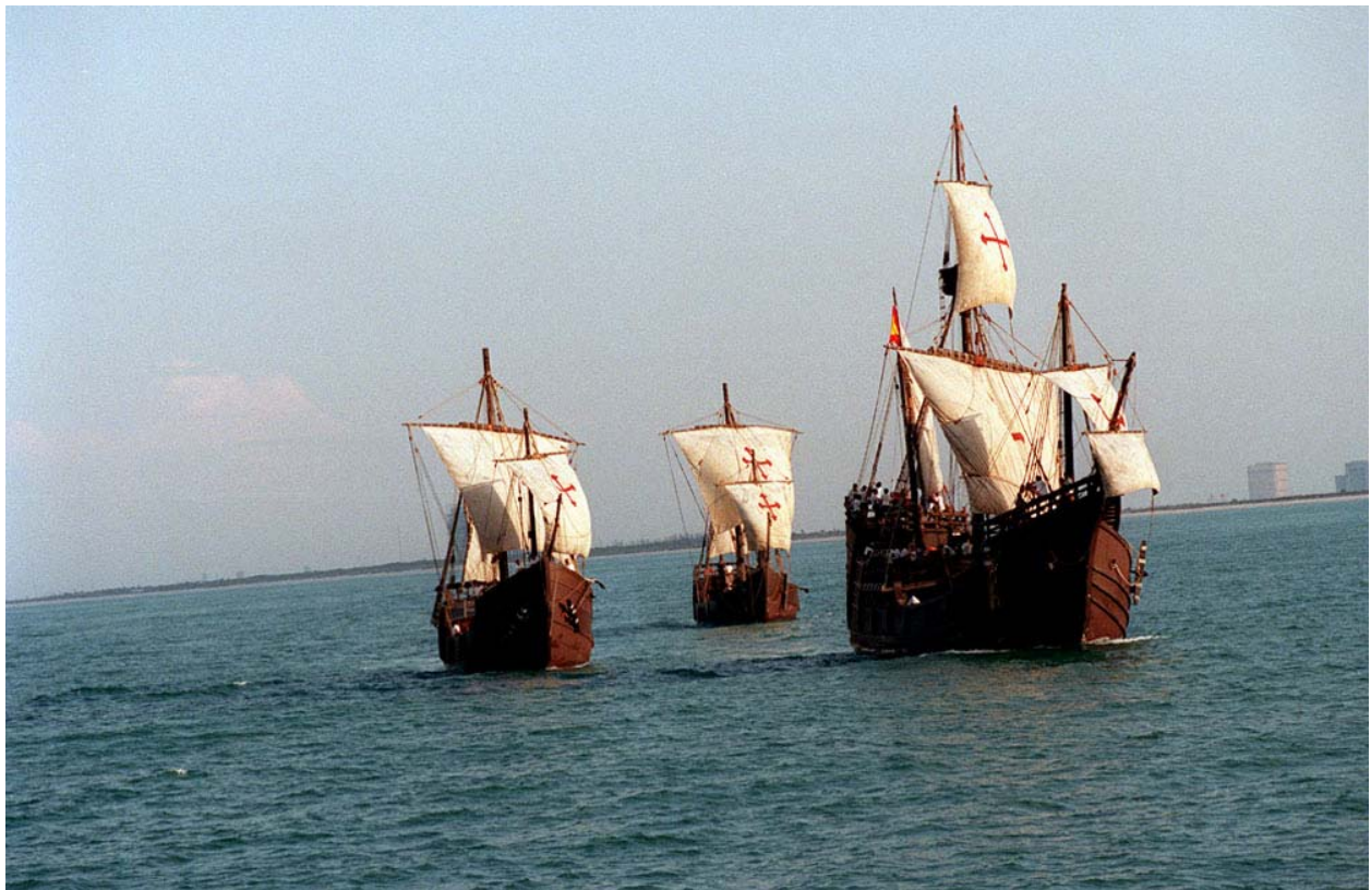
Replica Ships of Nina Pinta Santa Maria