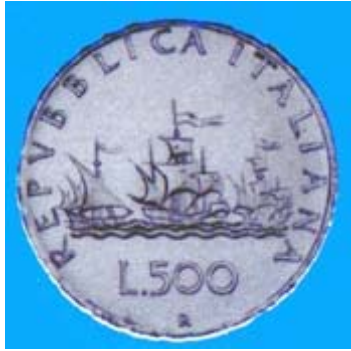
Nina on Italian Coin 1