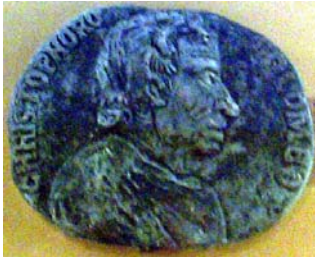
An original commemorative coin minted in Columbus' honor upon his triumphant return to Spain